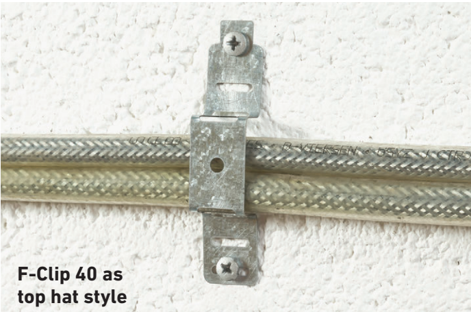
F-Clip 40 as top hat style