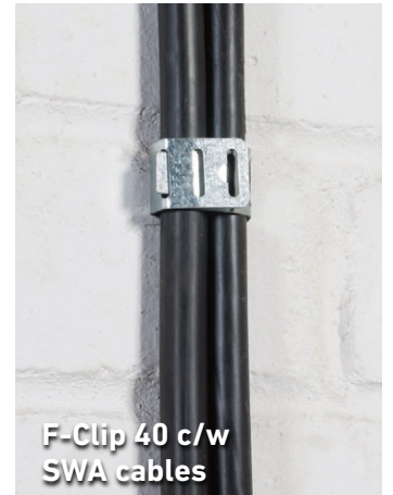
F-Clip 40 c/w SWA cables

Safe-D F-Clip 40 is a fire-rated flexible cable clip that is supplied in flat form, and can be quickly folded to make a variety of shapes to most effectively secure cable installations.