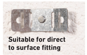
Suitable for direct to surface fitting

Safe-D F-Clip 30 is a fire-rated flexible cable clip that is supplied in flat form, and can be quickly folded to make a variety of shapes to most effectively secure cable installations.