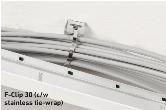
F-Clip 30 (c/w stainless tie-wrap)

Space efficient, pocket friendly & easy to handle